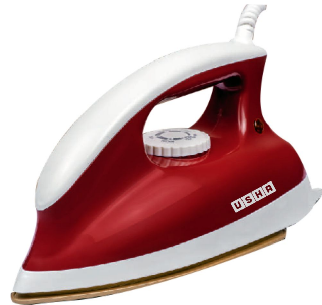
ELECTRIC IRON Model Name: Goliath Model No.: GO1200WG